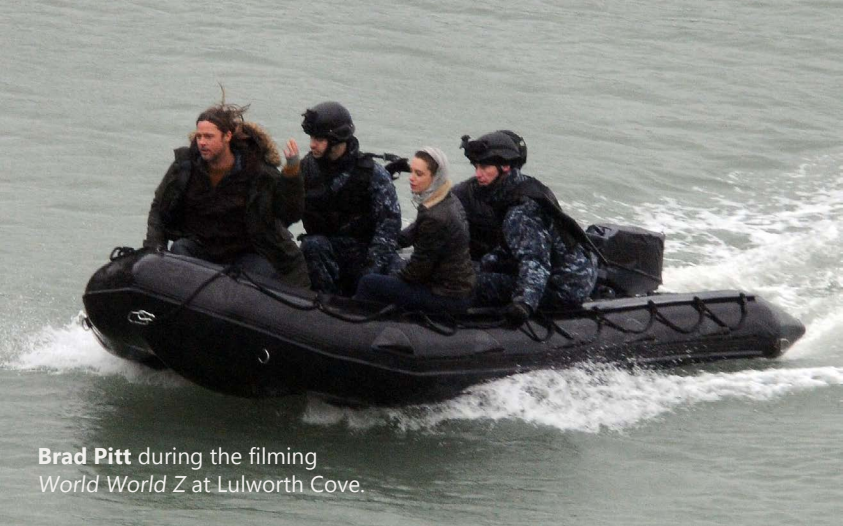
Brad Pitt during the filming World World Z at Lulworth Cove.