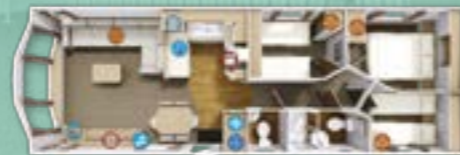
Sleeps 6, three bedrooms

PLEASE NOTE LAYOUTS MAY VARY. IMAGES SHOWN ARE FOR ILLUSTRATIVE PURPOSES ONLY. ALL HOLIDAY HOMES ARE NON-SMOKING.