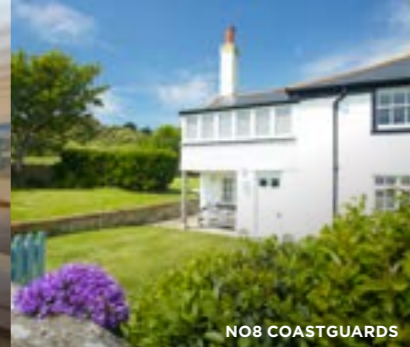
NO 8 COASTGUARDS