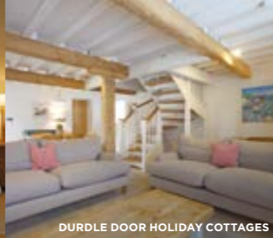
DURDL E DOOR HOLIDAY COTTAGES