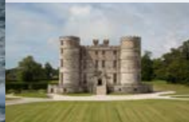
LULWORTH CASTLE & PARK

At the heart of the Estate is Lulworth Castle. Built to entertain aristocracy and royalty, this C17th hunting lodge and its extensive parkland is open to visitors to enjoy from April - December (closed Saturdays)