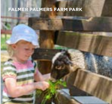
FALMER PALMERS FARM PARK

“Dorset is truly a magical place, we will be back next year for sure”