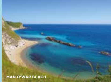
MAN O'WAR BEACH

"The ultimate playground for lovers of the outdoors"