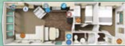
Sleeps 4, two bedrooms